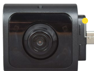
DC-DVR-4G-INTCAM Optional Driver Facing Internal Camera available