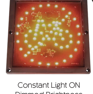
Dimmed Brightness From Light Sensor