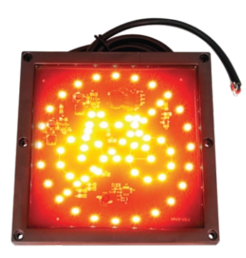
Constant Light ON