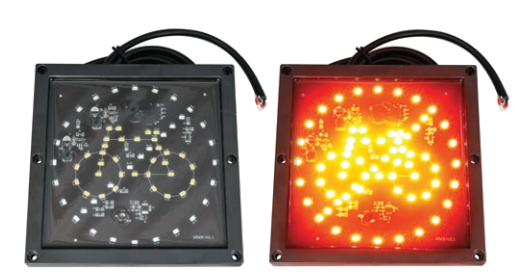
Flashing Light ON